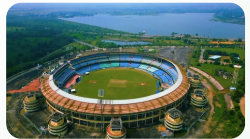
Shaheed Veer Narayan Singh International Cricket Stadium