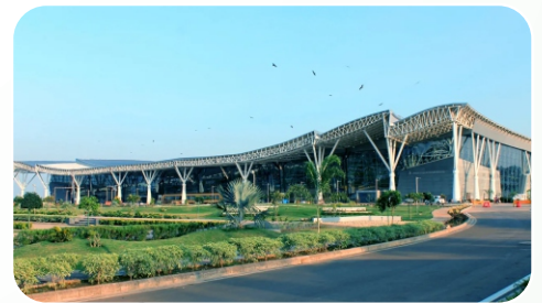
Swami Vivekananda Airport