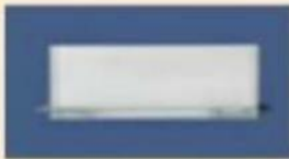
Glass Shelf - 1m x 0.3m