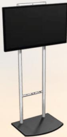
LED TV 50" with Stand