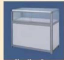
Glass Show Case 1m x 0.5m x 1m(Height)