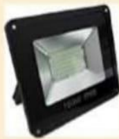
LED MH Light Size - 50/100 Watts