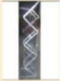
Brochure Stand Hire Charge - Rs. 1000/-