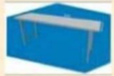
Table With Cloth Frill Size : 5 ft x 2 ft