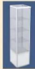
Glass Show Case 0.5m x 0.5m x 2m (Height)