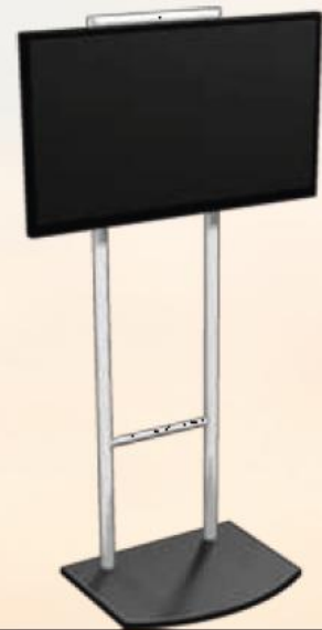
LED TV 60" with Stand

Contact: - for Additional Audio Visual requirements.