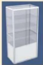
Glass Show Case 1m x 0.5m x 2m(Height)