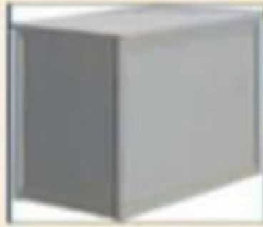
System Table 1m x 0.5m x 0.75m(Height)